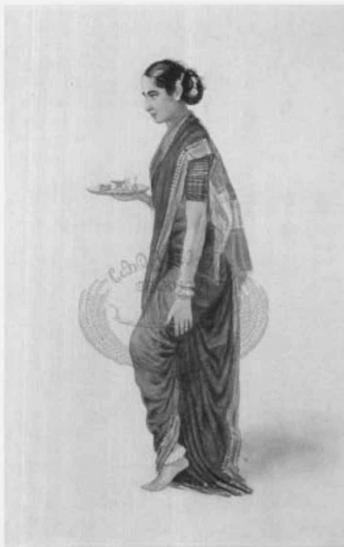
A BRAHMAN LADY GOING TO THE TEMPLE